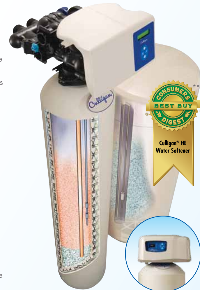
Culligan® HE outdoor model shown